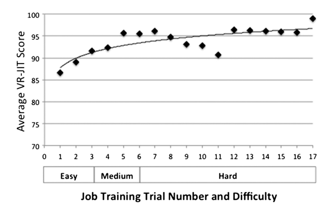
FIGURE 2. VR-JIT learning curve in adults with a psychiatric disability. This figure plots the mean score for each successive VR-JIT simulated interview trial. Trials 1 to 3 at easy, trials 4 to 6 at medium,

and trials 7 to 17 at hard. Model fit, R^2 = 0.65 .